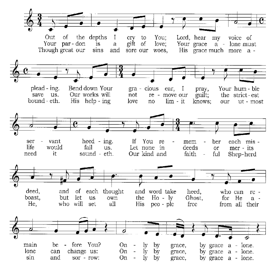
Text: Martin Luther, tune: David Ward, © 2002 ThousandTongues.org. Used by permission: CCLI no. 11373734